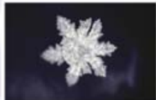
Same RO Water standing for 3 min on a Tri-Vortex™ disk.