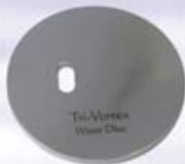
Tri-Vortex™ Water Discs 45mm 90mm