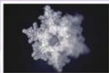
Same RO Water treated 30 sec with a Tri-Vortex™ green laser.

Create good tasting healthy water for best hydration. Tri-Vortex™ water discs are great for treating water for plants, animals and humans.